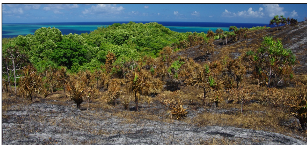
Figure 2. Savanna fires in Micronesia, like the one pictured here in Yap, often self-extinguish at the forest edge. However, reports indicate that severe drought during El Niño events increases fire intensity and the potential for forest loss.

Wildfire records from Hawaii and Guam demonstrate an increase in annual area burned during El Niño events 1,2 . These patterns suggest we can anticipate late onset drought during the winter months following El Niño development, and the subsequent need to ramp up preparedness for higher fire danger throughout the winter.