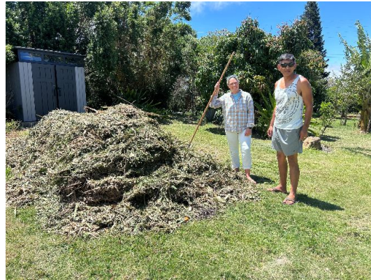
Hazardous vegetation before (left) turned into green waste mulch after (right)

What a way to kick off National Wildfire Community Preparedness Month! On May 22, ten households in Kamuela View Estates participated in the curbside chipper and green waste trailer event to reduce hazardous vegetation in and around their neighborhood. Check out our happy homeowners above! Neighbors and keiki coming together to prepare for wildfires way ahead of time is proof positive that we can turn vegetative fuel hazards into recyclable mulch and wood chips which can replenish the soil and prevent erosion. And mahalo Mayor Roth for supporting this work by waiving the green waste disposal fee for this community-led work!