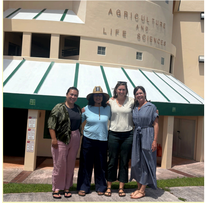
Pacific Fire Exchange meeting with professors at University of Guam to build collaborations and hear about current wildfire research projects.

“Connecting through online platforms and video conferencing is critical to PFX’s wide collaborations across the Pacific, but there is no replacement for gathering in person, sharing food and culture, talking story, and seeing the impact of wildfire on these landscapes firsthand.”